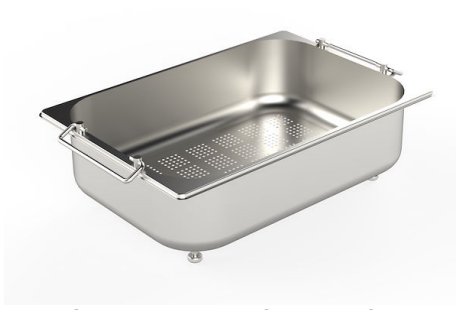
CUVETTE PERFOREE INOX