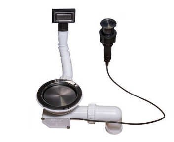
VIDAGE FADE PUSH GUN METAL A407 A20