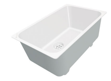
CUVETTE PLASTIQUE BLANCHE

* only in combination with the accessory A644 F04