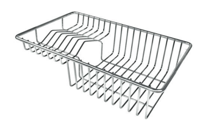
GRILLE POR.ASSIETTES INOX mm214x379