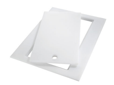
PLANCHE DE DECOUPE DOUBLE HDPE