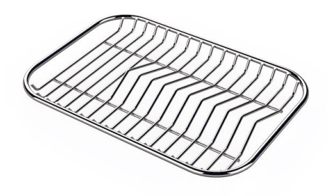
GRILLE PORTE-ASSIETTES INOX 25x35

* only in combination with the accessory A644 A01