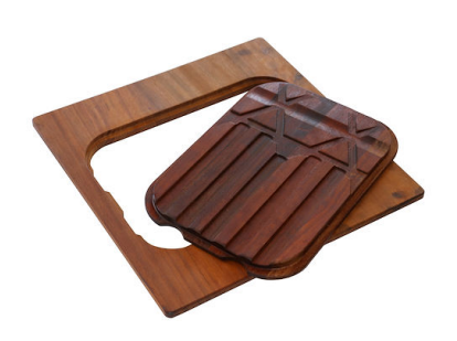
PLANCHE DE DECOUPE DOUBLE IROKO