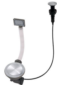
VIDAGE FADE PUSH INOX A407 A16