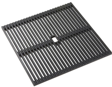
GRILLE NOIRE POUR EVIERS OPERA A100 E06