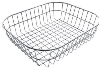
PANIER INOX POUR CUVE 34x40 CM A611 F00