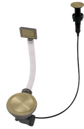
VIDAGE FADE PUSH GOLD A407 A21