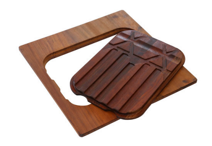
PLANCHE DE DECOUPE DOUBLE IROKO