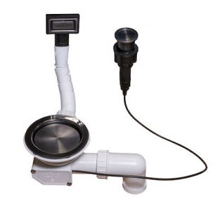
VIDAGE FADE PUSH GUN METAL