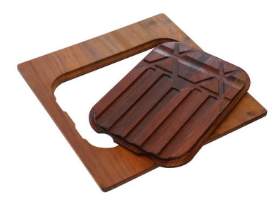
PLANCHE DE DECOUPE DOUBLE IROKO A644 F04