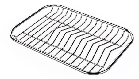
GRILLE PORTE-ASSIETTES INOX 25x35 A100 A54 * only in combination with the accessory A644 F04

GRILLE POR.ASSIETTES INOX mm214x379 A100 C03 * only in combination with the accessory A644 A01