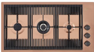
MILANO 3 BRULEURS COPPER G680 F08