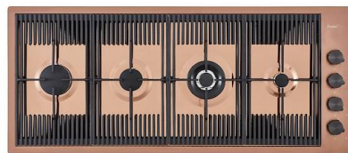
MILANO 4 BRULEURS COPPER G681 F08