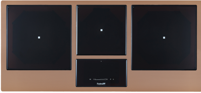
TABLE CUISSON INDUCTION GEMMA LIGNE INOX