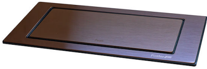
SUPPORT DE PRISE VERSO COPPER A000 A18