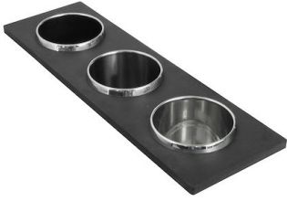
PORTE-BOUTELLES POUR EVIERS CONVIVIO A100 E21