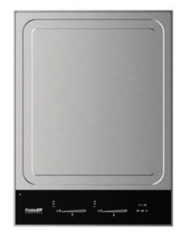
Table de cuisson Teppanyaki