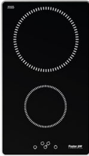
Table de cuisson Ognidove