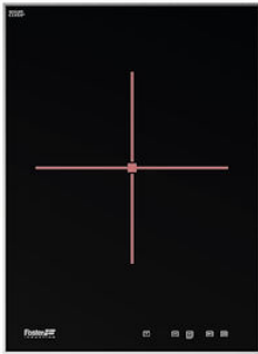
Table de cuisson Ognidove